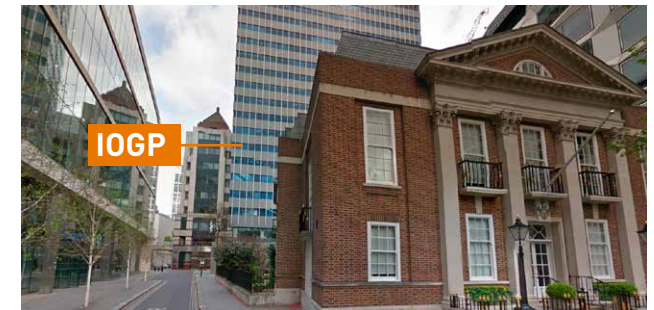
Looking down Basinghall Ave