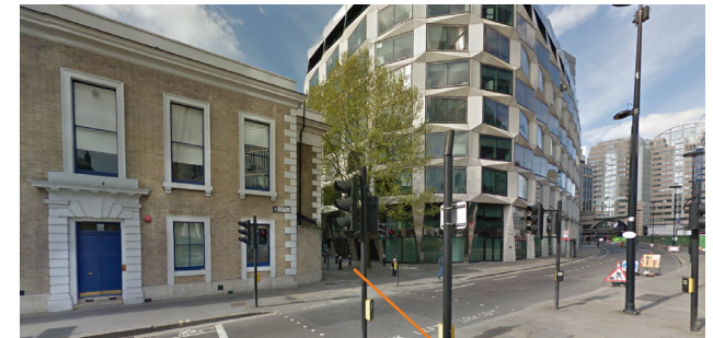
London Wall, view to Coleman St pedestrian access