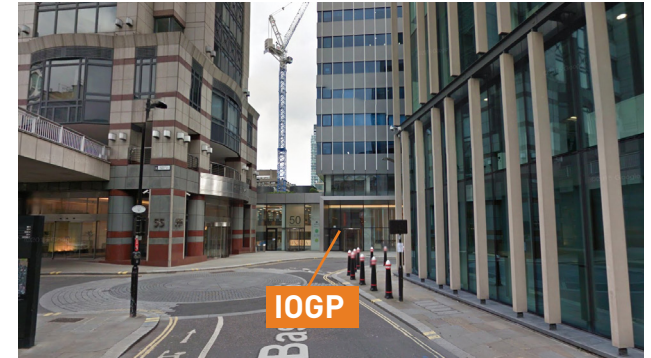
Walking from North (such as Moorgate or Liverpool St)